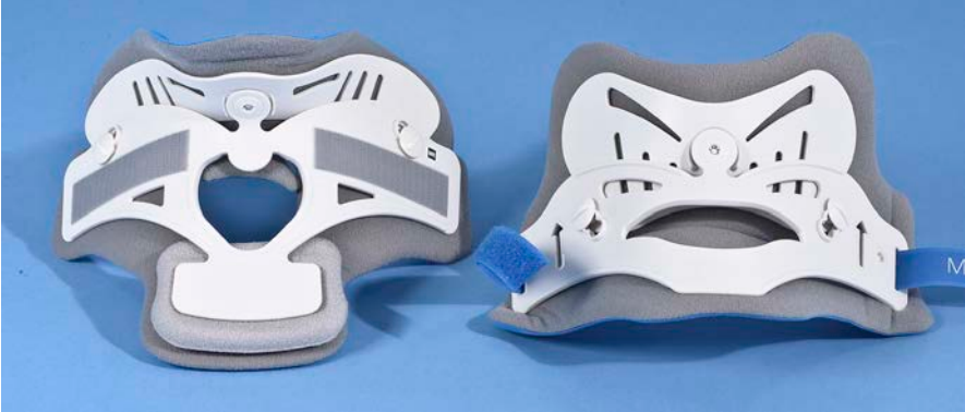
Front of Collar