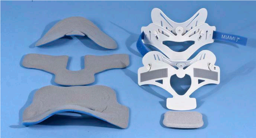
Collar with pads removed